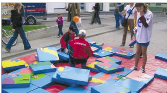
9 th of May celebrations in Brussels