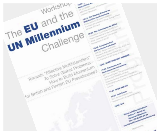
Workshop on: “The EU and the UN Millennium Challenge”, March 2005

In November 2004, the EMI welcomed the new members of the European Parliament and the new Commissioners, especially those from the new EU member states, to a specially organised reception, which was held under the patronage, support and presence of the President of the European Parliament, Mr Josep Borrell. Also invited were the diplomatic corps in Brussels. The reception was attended, among others, by the Vice-President of the European Commission, Mr Jacques Barrot, as well as many MEPs, ambassadors and officials from the European Commission. A special brochure “The Vision for Europe” was produced for this event.