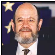
José Maria Gil-Robles, President