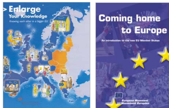
Enlarge Your Knowledge brochure DVD "Coming home to Europe"

For more information please consult the website www.europeanmovement.org/enlargement