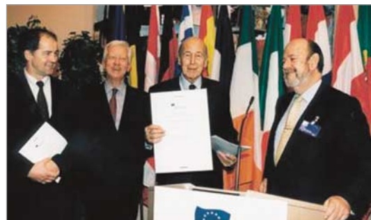
Presentation of the EMI resolution on the European Constitution to Valéry Giscard d'Estaing