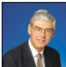
Alan Dukes, Vice-President