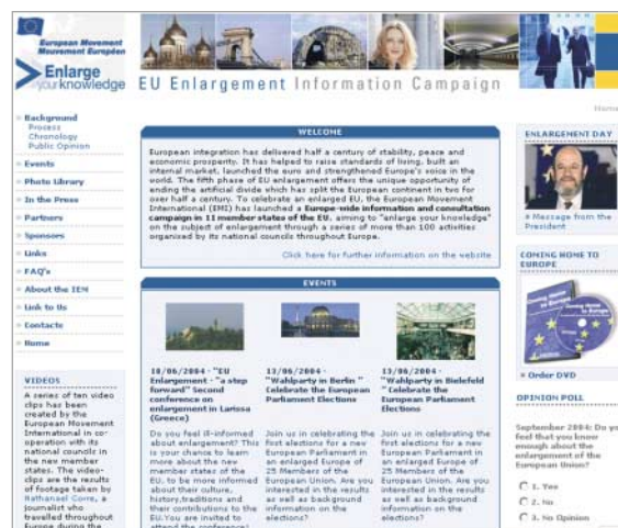
Enlarge Your Knowledge website