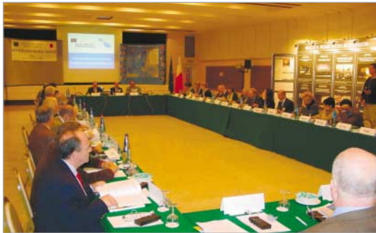
Preparatory Conference of the North-South Mediterranean Dialogue, Malta 2004.