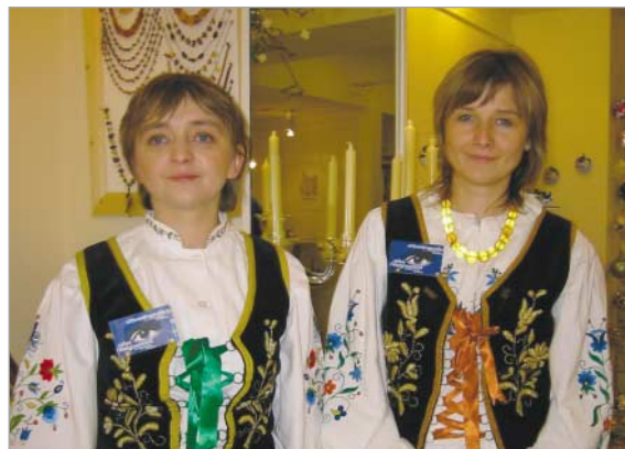
Enlargement Rally in Brussels