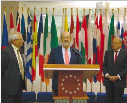
Welcoming reception in the European Parliament, November 2004.