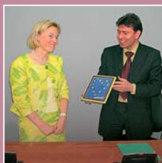
The European of the Year Award Ceremony

The Union of European Federalists in cooperation with the European Youth Movement-Bulgaria and Europe House-Sofia organised several events in three Bulgarian cities: Sofia, Plovdiv and Vidin.