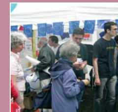
The European Institutions Open Doors' Day in Brussels