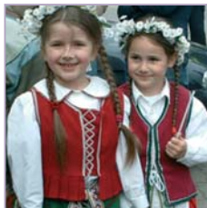
Participants in the festivities

The European Movement Poland in partnership with the Children's Friends Association held a number of activities in Sejny, a culturally and ethnically diverse town, near the Lithuanian border.