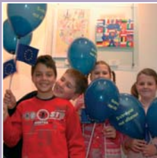
Young participants in the exhibition

The European Movement Serbia celebrated the 9th of May with a series of activities in Belgrade and 30 other cities all over Serbia where the EM has Local Councils. The overall project idea, contained in the title “Europe in your palm”, was to make the Serbian public aware of European Integration.