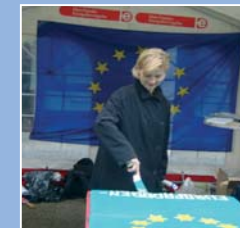
The European Cake in Copenhagen