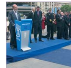
Speech of Mr. Gil-Robles, President of the EMI, in Madrid on the 9th of May