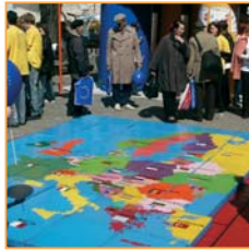
Map of Europe