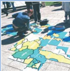
Map of Europe