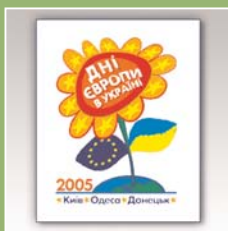
"Orange" Europe Day