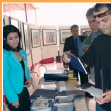
European info stand