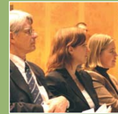
Public event on the 9th of May