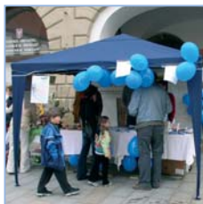
Europe Day info stand in Plzen