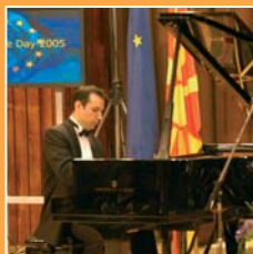
Concert on Europe Day

On the occasion of the 9th of May, a 'Europe week' was organised between the 1st and the 10th of May in order to celebrate the Schuman Declaration's Day.