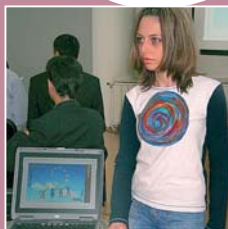
Young people present their visions of Europe