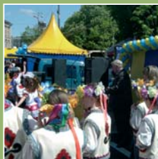
Festivities in Kiev

The European Movement Ukraine organized the Europe Day in Kiev in partnership with the Ministry of Foreign Affairs of Ukraine, the Kiev State Administration and the "Chaika" Municipal Festival.