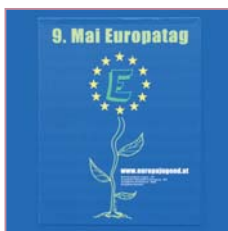
9th May Poster

Once again the European Movement Austria celebrated Europe Day with several different activities on the 9th May. EM Austria paid special attention to the diversification of the locations where the activities took place.