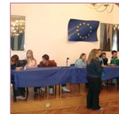
Euro quiz on Europe Day