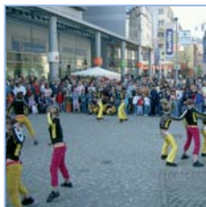
Festivities on the 9th of May

One year after the accession to the European Union, the European Movement Czech Republic organised festivities again this year on the 9th of May.