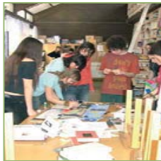
Young participants in Budapest

European Movement Hungary organized in cooperation with Europe House and Center for Foreign-Policy Studies several events in order to celebrate Europe Day.