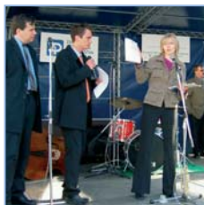
Public event in Praha