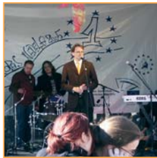
Presenting Europe Day