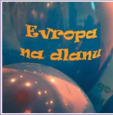
Europe Day festivities in Belgrade