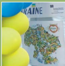
Europe Day information stand