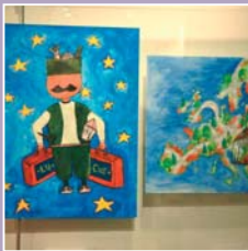
European designs for the 9th of May