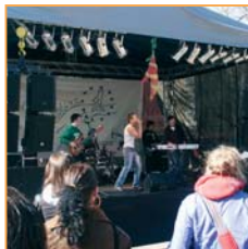
Concert in Riga

The European Movement Latvia organised several activities across the country in order to celebrate the 9th of May – Europe Day. The two main events were held in Riga with six other regional events taking place throughout Latvia.