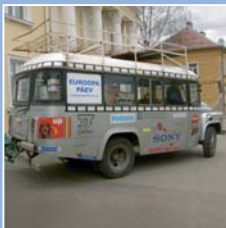
The European Rally Car

European Movement Estonia, in cooperation with many partners and sponsors organised a “European Week” – which consisted of a number of activities taking place in Haapsalu, Paide, Põltsamaa, Otepää, Rakvere and Tallinn.