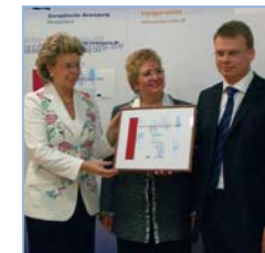
Presentation of European Contribution of the Year Award