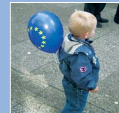
Young participant in the Europe Day festivities