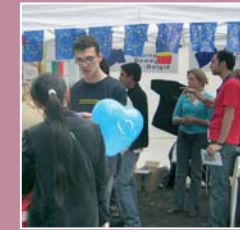
9 May stand, Parc Léopold, Brussels