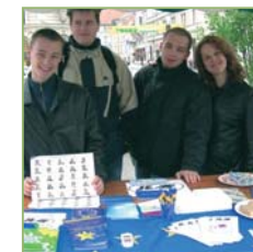
JEF Stand on Europe Day