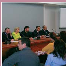
Conference on the 9th of May