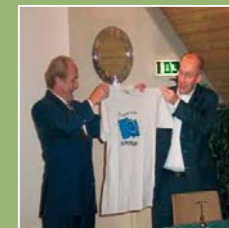
The Award Ceremony