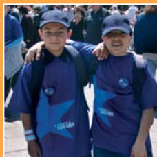
Young participants in the European events