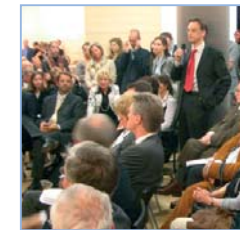
Dialogue with Civil Society