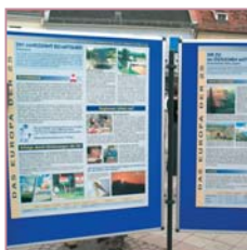
Exhibition on the Enlarged Europe