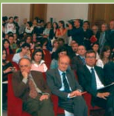
Section of the audience

The Italian Council of the European Movement organised a big one-day event at the University of Catania, in Sicily, split into two main events: a conference and a forum with civil society.