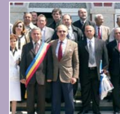
9 may participants