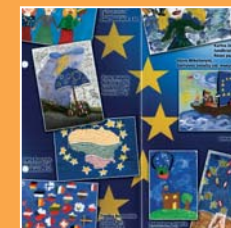
Europe Day brochure