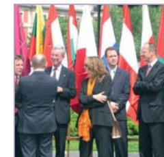
Personalities attending the solemn hoisting of the European Flag