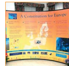
Europe Day theme in Malta