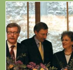
The Award Ceremony