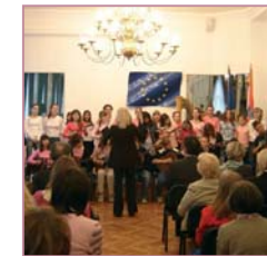
Award ceremony 'Europe at School' on the 9th of May