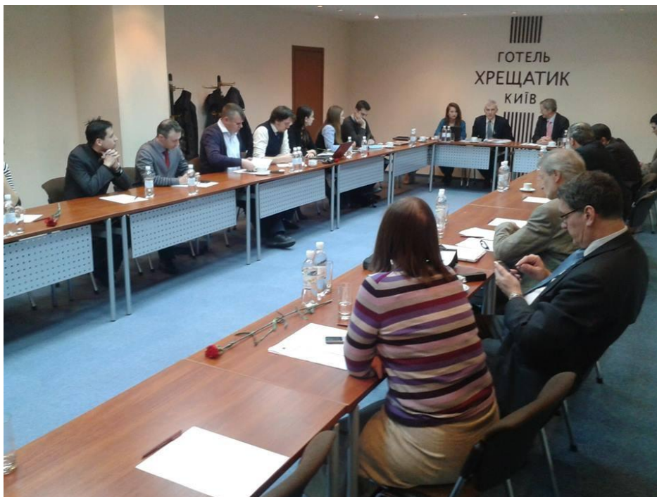
Meeting on the establishment of the European Movement Ukraine, Kyiv, 8 th March 2014