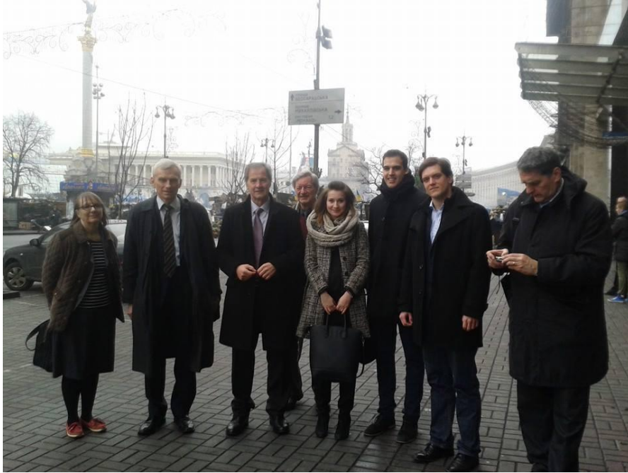
European Movement International's Delegation in front of the Maidan's barricades, 6 th March 2014